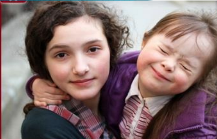
The purpose of life is a life with purpose

It is our mission to provide a coordinated system of quality recovery oriented care to the citizens we serve. We continually strive to value staff, support diversity, and promote excellence in the provision of consumer care.