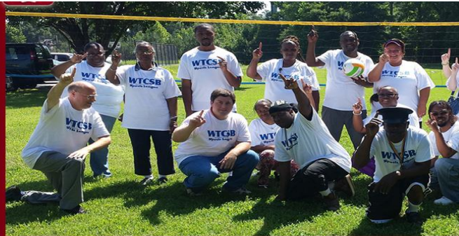
The purpose of life is a life with purpose