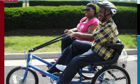
The purpose of life is a life with purpose